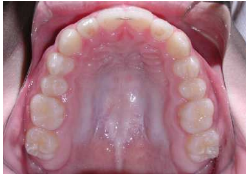
Upper lingual fixed